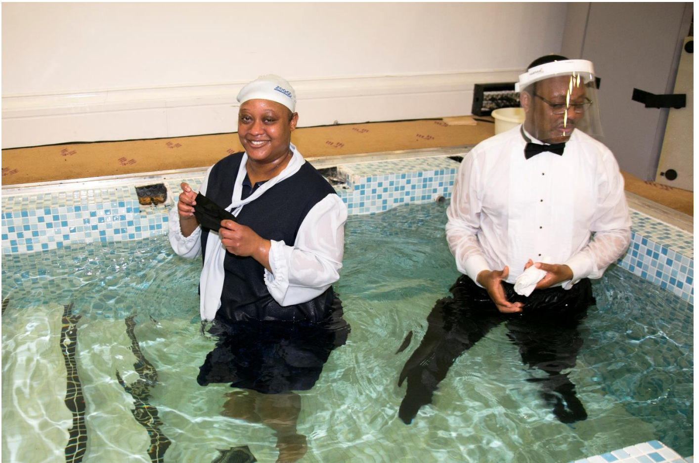
Shimmarie just after her immersion: relaxed and smiling