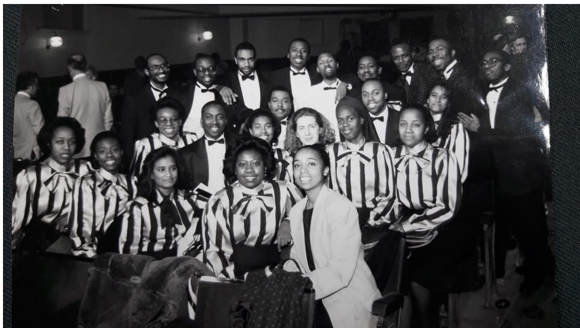
The Adventist Chorale who won BBC Choir of the Year in 1994

Q7: What is your most memorable moment in your music ministry?